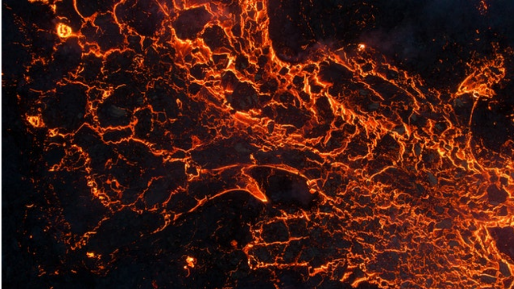
Figure 1: Ideal place for melting rings